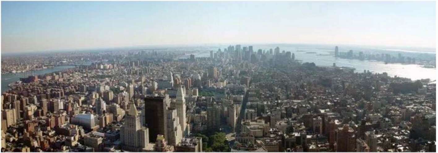
Aerial view of Manhattan, looking south

Perhaps never before in New York City has so much new housing been in the pipeline at one time. The question is how long we can sustain this pace, especially now that an important New York State affordable housing incentive program, called 421-a, has been allowed to lapse.